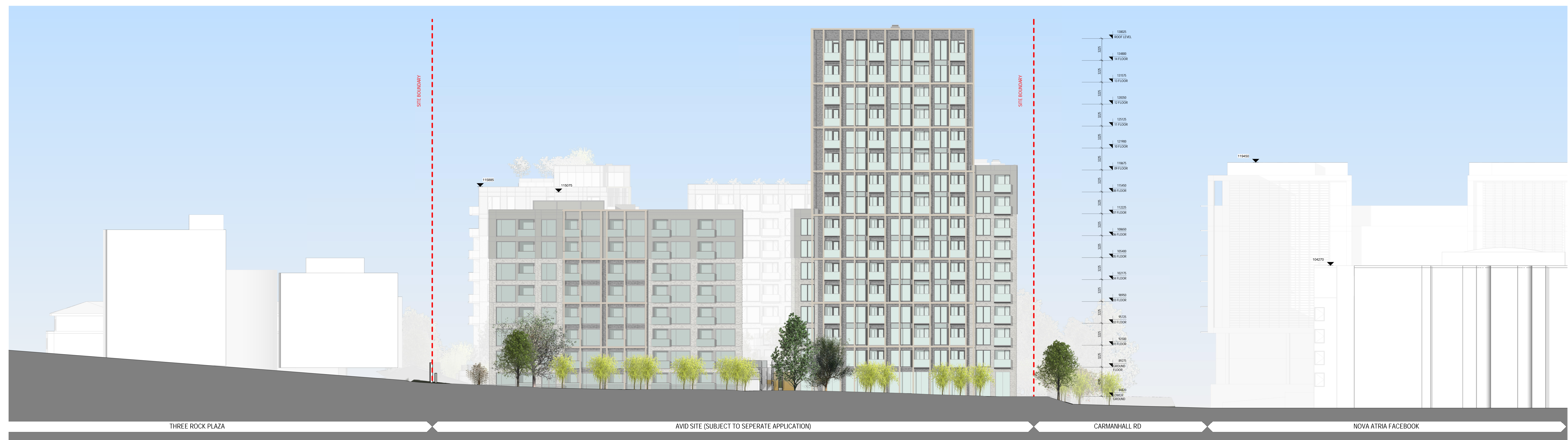
① PROPOSED SOUTH EAST CONTEXTUAL ELEVATION Scale: 1 : 200